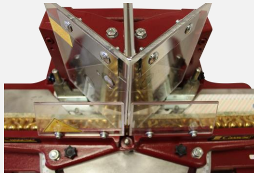
Protective clear safety guards Minimizes blade exposure to the operator