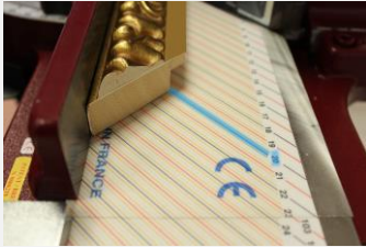
1 meter (39 1/2") measuring arm With 4 colours direct read measuring scales