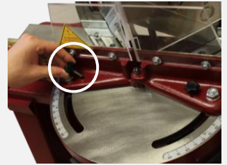
Fence locator pins Give an accurate 45° cut every time