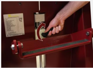
Tool-less blade height adjustment User-friendly, safe and accurate