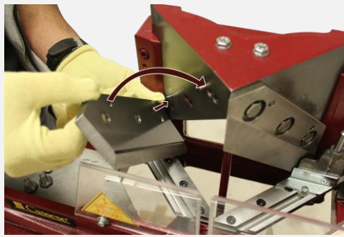
Blade locator pins For quicker and safer blade changes