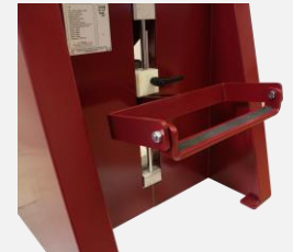
Large foot pedal Featuring an anti-slip rubber grid